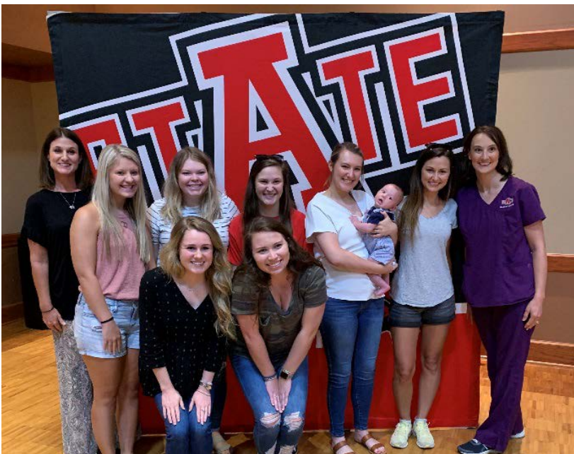
The Diagnostic Medical Sonography Class of 2020 poses during the inaugural Elevation Event in August.