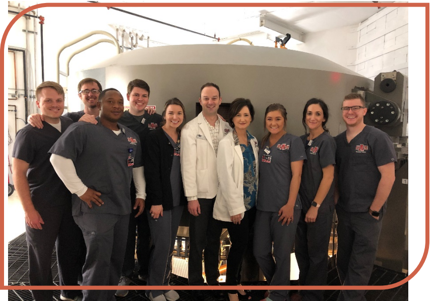
The Radiation Therapy program visited the Willis Knighton Proton Center in Shreveport, LA.